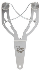
Use hand-held, right or left handed

Stainless steel is corrosion and rust resistant. Proper cleaning and sanitizing procedures must be followed to maintain the integrity of the Ergo Steel Stainless. The choice of cleaning method and the frequency of its application depends on the nature of the process, the product being processed, the deposits formed and hygiene requirements. Chemical disinfectants are often more corrosive than cleaning agents and care must be exercised in their use. Due to the variety of chemical disinfecting agents available, we strongly recommend an evaluation be performed to determine the effect of your cleaning agent, used at normal concentrations, on the stainless steel.