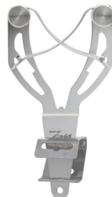
Optional bracket installed for use at work table height