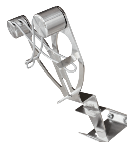
Optional bracket installed for use at elevated height