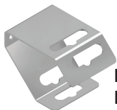
Part No. HES-3B

Optional 2 position bracket (available separately) holds your HES-SB2-WO Ergo Steel-Stainless Wide Opening at perfect angles for tabletop or elevated height use.